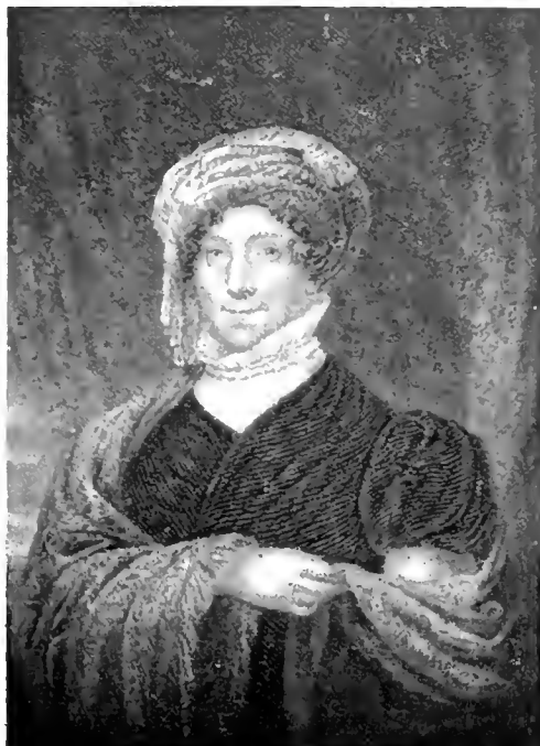
DOROTHY PAYNE MADISON.

management of society contributed powerfully to the success of President Madison's administration. During all the stirring scenes of that period, including the sacking of Washington by the British,